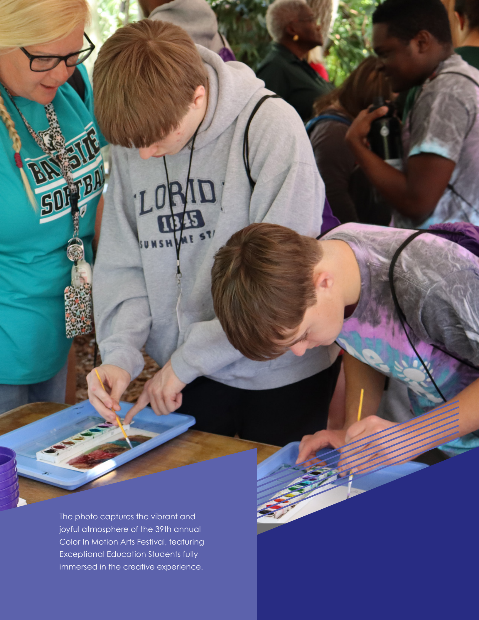
The photo captures the vibrant and joyful atmosphere of the 39th annual Color In Motion Arts Festival, featuring Exceptional Education Students fully immersed in the creative experience.